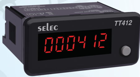
36 x 72mm